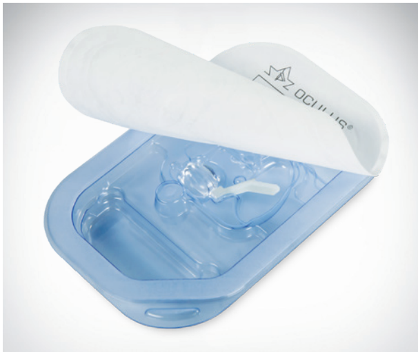
Convenient and sterile blister package