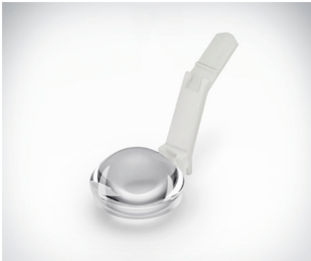
OCULUS HD Disposable LenZ