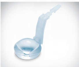
BIOM ® HD Disposable Lens