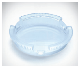
New reduction lens increases surgical efficiency