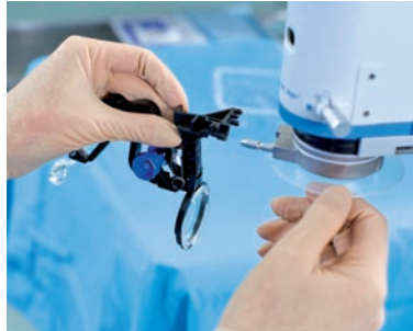
Connects easily to your microscope