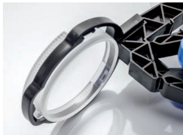
New reduction lens is designed to optimize the view of the retina and the limbus, increasing surgical efficiency