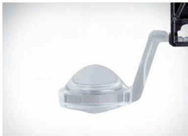
130° wide angle field of view with outstanding resolution in the periphery