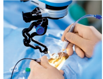
Ready for use

Specifically designed to optimize performance with either a f=175 mm or f=200 mm microscope objective lens.